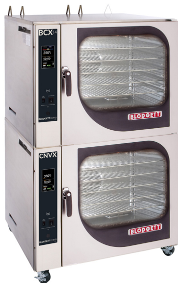
Shown stacked under a Blodgett BCX-14G Combi Oven both shown with optional SmartTouch2 controls

Refer to BCX-14G and BX-14G specification sheets for information on the combi ovens.