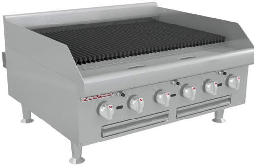
Model shown Model HDC-36