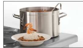
Large 5" (127 mm) stainless steel landing ledge for convenient plating.