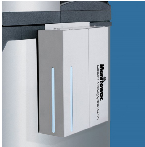
iAuCS for External Mounting