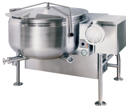
Shown with optional Spring Assisted Cover and 2" Tangent Draw-Off Valve